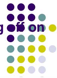
Percentage of nurses per ward who has completes e learning and signed off on the LP- HV - 0001, LP - HV - 0002, LP - HV - 0004 policies (20/04/08)